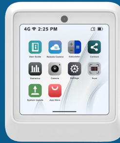
No IC (Optional)