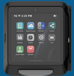
With MSR (Optional)