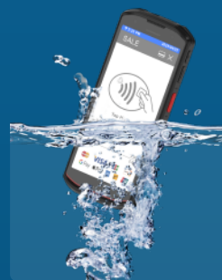
Underwater NFC Payment