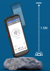
1.5M Drop Proof